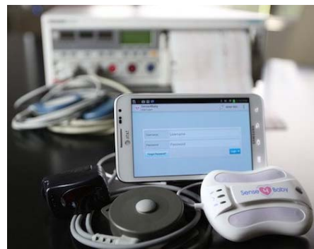
Figure 2. Sense4Baby Prenatal Monitoring System

Obstetrician-gynaecologists can use their iPhone for monitoring their patients' deliveries with the help of this system (Figure 2), which sends real time data (mother's and baby's heart rate, contractions and oxygen levels) from sensors wrapped around a patient's belly. Before this device, doctors had to interpret the explanations of maternity ward nurses regarding lines of heartbeat. If their description was unclear/unsatisfactory, doctors would have to return to hospital and see and assess important measurements [13]. Now, this type of monitoring and necessary assessments can be done via smartphone in real time and adequate courses of action can be taken.