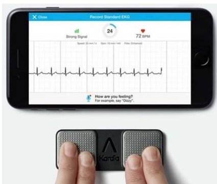
Figure 1. Using Kardia Mobile

One of the exams which a patient can perform on her/his own is EKG in 30 seconds. Heart diseases and stroke are hidden killers of world population [18]. E.g. stroke is the fourth cause of death [5] and the leading cause of survivors' disability in the USA, but up to 80% of stroke cases could be prevented [6]. It is estimated that the number of strokes will increase for 34% till 2035 in Europe [7]. In Serbia, stroke is the leading cause of death [8, 9]. EKG could help in anticipating these diseases. Kardia Mobile is a small device slightly bigger than a thumb drive. Its measurements are 8.2 x 3.2 cm and it is powered by a CR2016 coin cell battery, which can last for 200 hours. When connected with a smartphone app (for iOS and Android operating systems), it gives EKG readings anytime, anywhere. It has two electrodes on the surface; user puts two fingers on each electrode (Figure 1) and runs a scan which lasts for 30 seconds. Therefore, a patient can find out right away whether her/his heart rhythm is normal or not [10, 11]. When this data is sent to a Cloud, a doctor can download the data and, decide the best course of action.