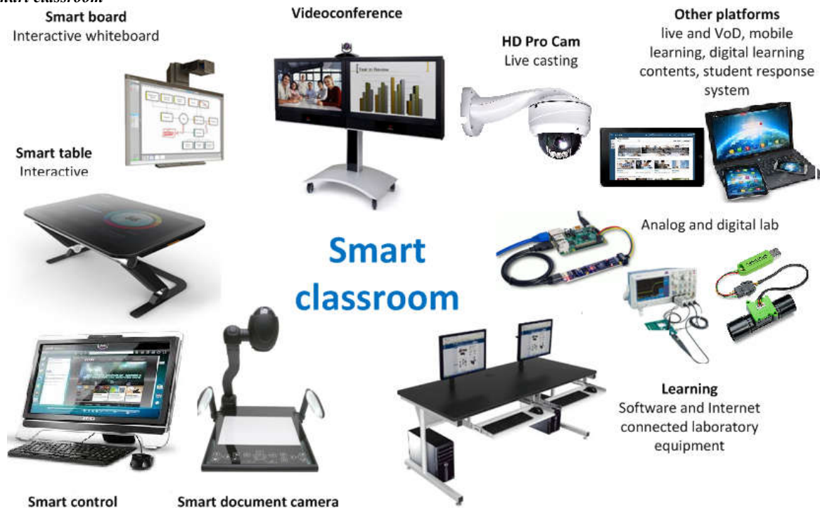
Figure 1. Smart and interactive environment at engineering education institution

The intensive technology advancements have dramatically changed the classroom in the last decade. The Internet of Things (IoT), which refers to the internetworking of Internet-aware devices, has played the significant role in transforming education processes. With the help of sensor technologies, radio frequency identification (RFID), Cloud computing technologies, big data analytics, and e-learning platforms, the vision of smart and interactive classroom, consisted of smart devices that have Internet capabilities and can be controlled and tracked through the Internet, becomes reality (Fig. 1). In the other words, smart technology and Internet connectivity have changed the approach of how the universities teach and students learn [1].