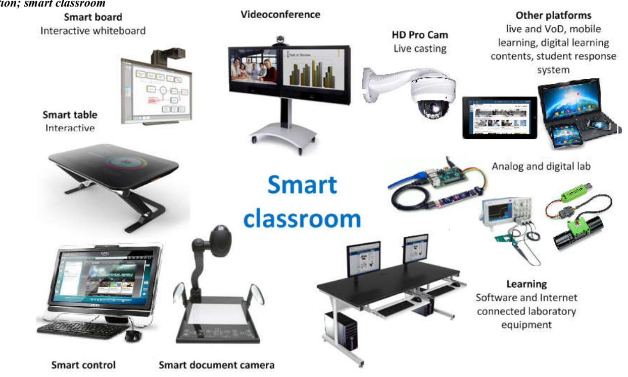
Figure 1. Smart and interactive environment at engineering education institution

The intensive technology advancements have dramatically changed the classroom in the last decade. The Internet of Things (IoT), which refers to the internetworking of Internetaware devices, has played the significant role in transforming education processes. With the help of sensor technologies, radio frequency identification (RFID), Cloud computing technologies, big data analytics, and e-learning platforms, the vision of smart and interactive classroom, consisted of smart devices that have Internet capabilities and can be controlled and tracked through the Internet, becomes reality (Fig. 1). In the other words, smart technology and Internet connectivity have changed the approach of how the universities teach and students learn [1].