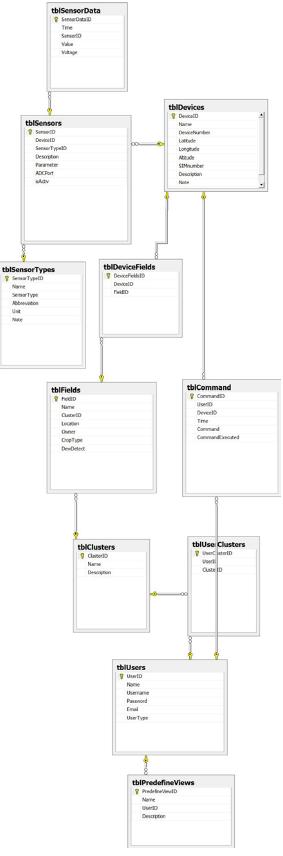
Figure 5. Most important database tables

Database for the application has been developed on the Microsoft SQL Server. The Microsoft SQL Server is a system for management, deployment and analysis of the database. It can be defined also as a modern relation database with additional tools like the question console, database management tools, database work supervision [13]. Developed database contains 36 tables. Most important, including their relations are displayed in the Fig. 5.